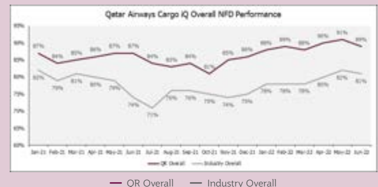
Qatar Airways Cargo iQ overall NFD* performance

Cargo iQ is an IATA interest group with the aim of developing and overseeing standards on quality and efficiency improvement in the worldwide air cargo industry. Qatar Airways, a proud member of Cargo iQ since 2009, strives not only to become the leading airline in the industry but also exceed in delivering quality of service for all our customers.